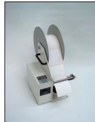
LD-100-RS with Flanges and Counter