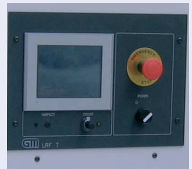
Easy to use touch screen