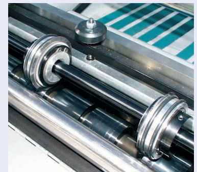
Rotating length slitting